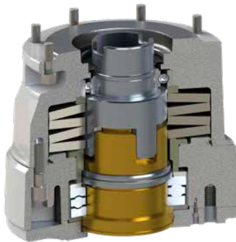
Fig. 1.1 Rotork Thrust Compensator

⚠ CAUTION: Each compensator is individually configured for the specific, individual valve details provided. It is therefore mandatory that each actuator-compensator assembly remains paired and is fitted only to the intended valve as specified with the enquiry/order.