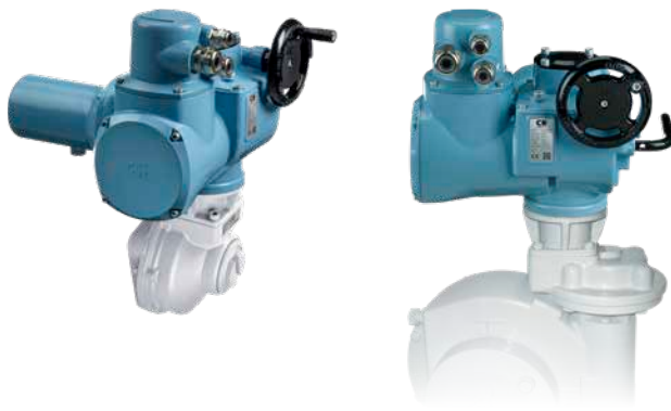
CK actuators plus Rotork second stage gearboxes

Thrust base types are separate to the gearcase allowing easy installation. Should the actuator be removed, the base can be left on the valve to maintain its position. All base dimensions and couplings conform to attachment standards ISO 5210 or MSS SP 102.