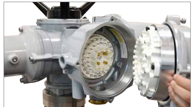
Plug and socket field wiring connector removal