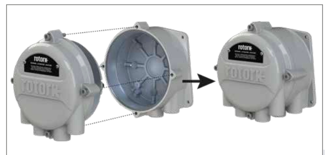
Optional parking cover for safe and secure storage while disconnected from actuator