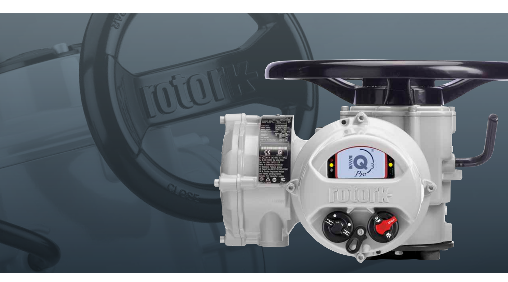
Electrical Data – Single-Phase Power Supplies