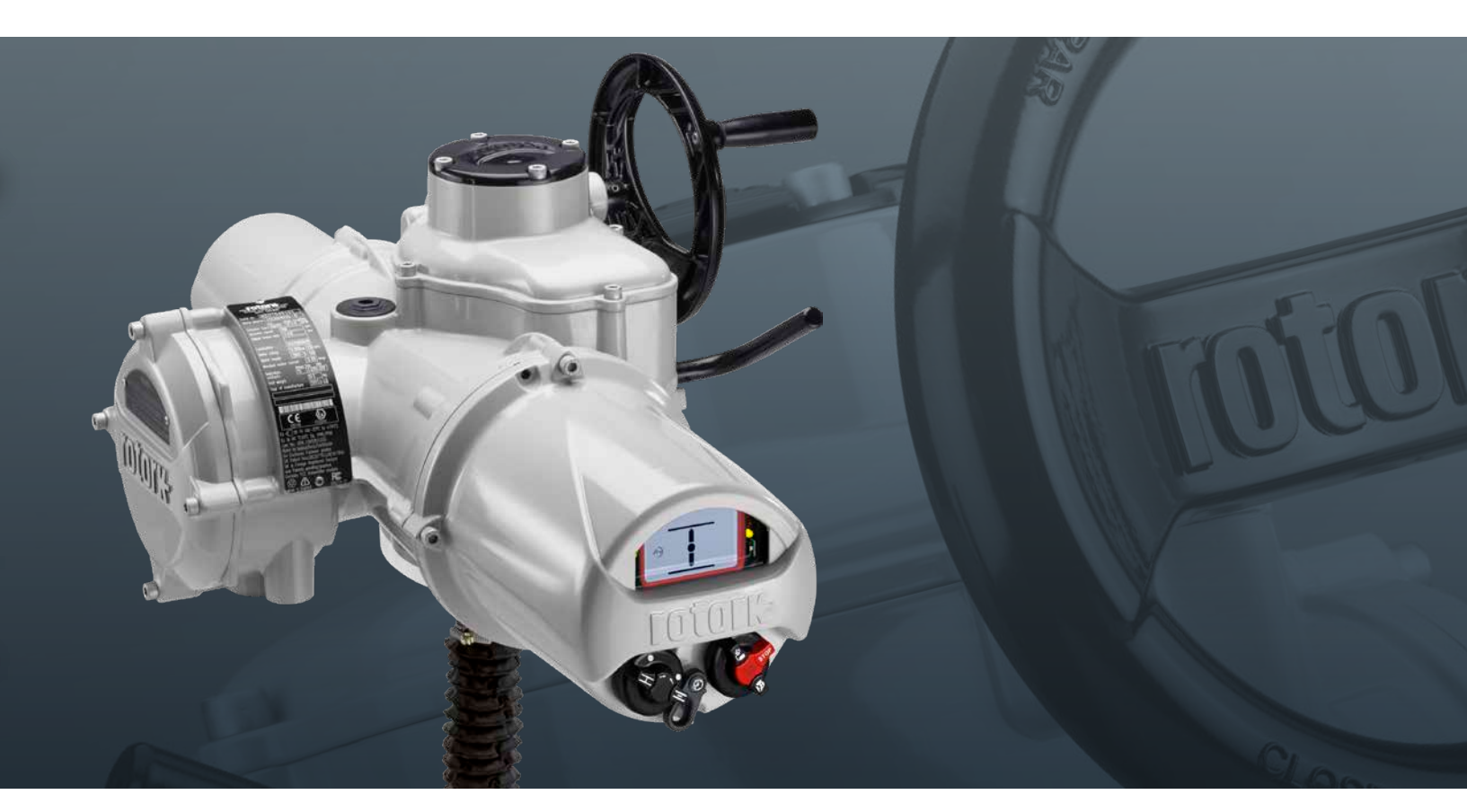
Electrical Data for Modulating Actuators – 3-Phase Power Supplies