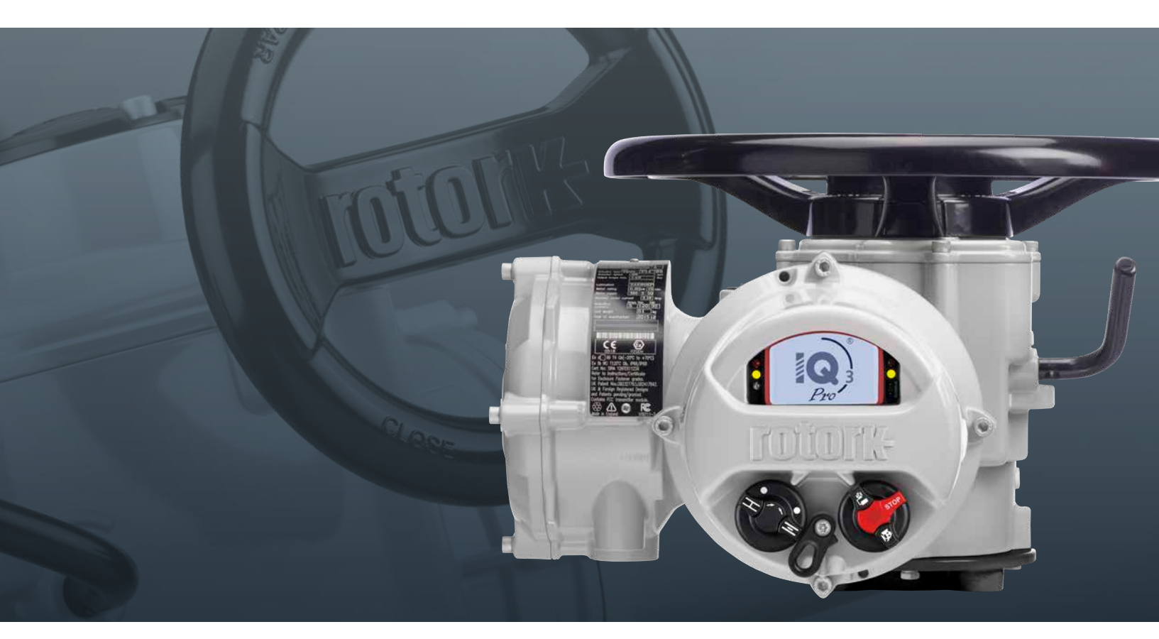
Electrical Data - DC Actuators