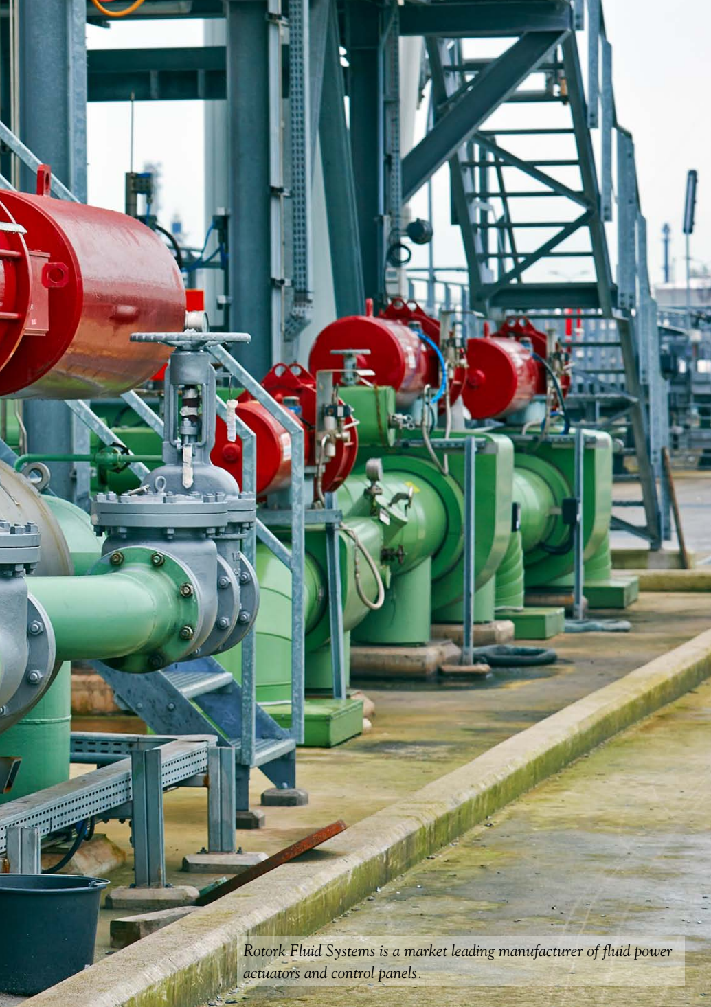
Rotork Fluid Systems is a market leading manufacturer of fluid power actuators and control panels.

Once inside, the well-marked walkways allow exceptionally close access to all key areas. Mr. Littlejohns: "When acquired this building was an empty shell, so we have been able to design the internal layout to meet our exact needs. One of the first things I insisted on doing was to incorporate a safe, circular pathway, such that visitors can view our stores, assembly and test areas up close without having to don protective clothing."