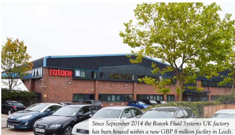
Since September 2014 the Rotork Fluid Systems UK factory has been housed within a new GBP 8 million facility in Leeds.

Asked to provide examples Mr. Littlejohns quickly lists power generation, water and wastewater treatment, petrochemicals, marine, HVAC, and general industry before noting an initially surprising sector - nuclear power. "Many countries see nuclear power as an important part of their energy mix. Therefore we have been further developing our range of Hiller fluid power valve actuators, electric actuators and gears to meet the current and future needs of this