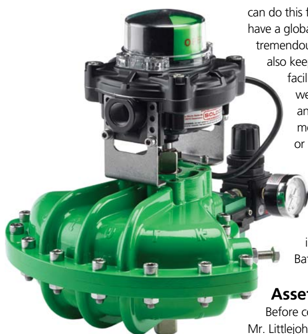
Example of the K-Tork pneumatic vane actuator, packaged with equipment from Rotork Instruments (switchbox and pressure regulator).

specific market. Key Hiller products include actuators for the main steam isolation valves as well as the main feedwater isolation valves. Incidentally, we have the know-how and approvals to deliver turn-key packages to clients, by which I mean the complete valve and actuator assembly."